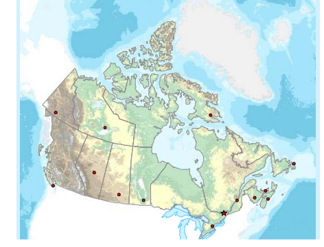
Figure 1. MAP from NRCan site: Mapping Federal-Provincial-Territorial Mining Knowledge

populated with orphan and abandoned mines for several jurisdictions (i.e. Ontario, British Columbia, Manitoba, Yukon and Northwest Territories). Subsequent phases would integrate datasets for the other provinces and territories to produce a nation-wide inventory. A nation-wide inventory would greatly assist in decision-making processes. However, improved statistical and technical information is also necessary to better quantify the liabilities and would help identify the priorities to which resources are directed in the future.